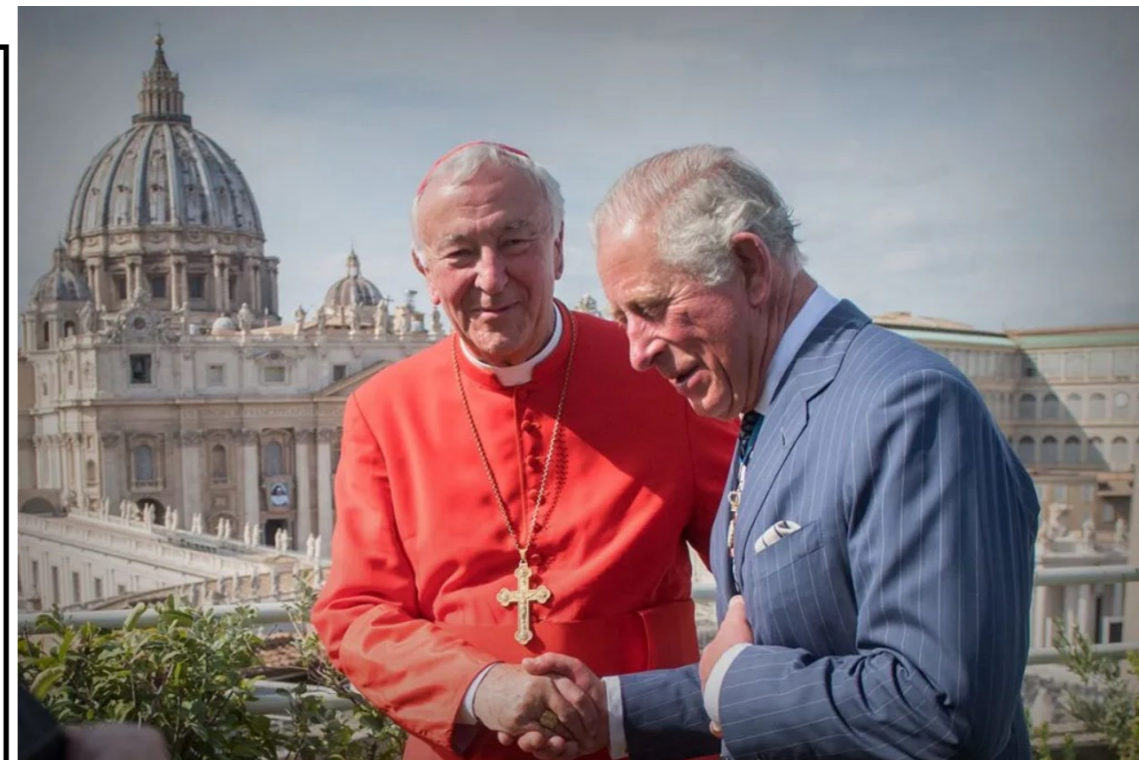
King Charles III when he was Prince of Wales at the Canonisation of St John Henry Newman

----- This Parish is part of Westminster Roman Catholic Diocesan Trust (WRCDT) Registered Charity No: 233699